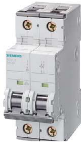
CIRCUIT BREAKER 400V 10KA, 2-POLE, A, 10A, D=70MM