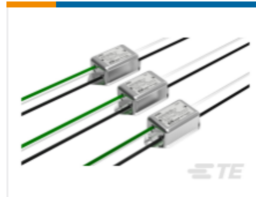
TE Part #9-1609095-0 CORCOM FB SERIES SINGLE PHASE FILTERS