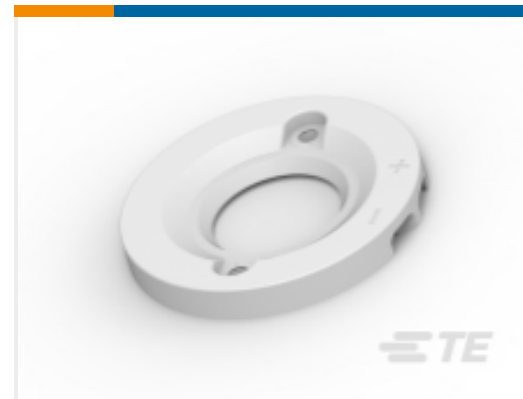
TE Part #2213382-2 Z50 ZHAGA PROFILE LED HOLDERS