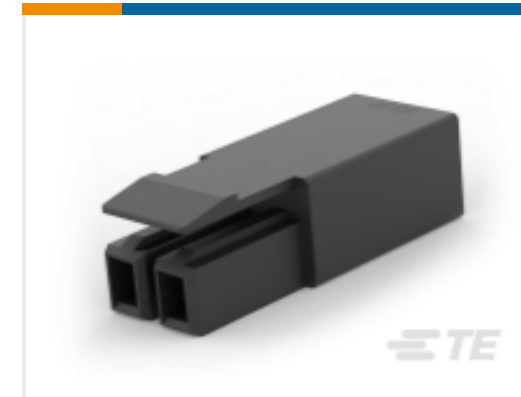
TE Part #2834048-4 LIGHT-N-LOK MODULAR LATCHED PLUGS