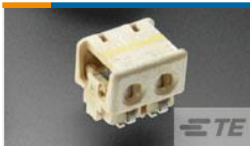
TE Part #2106431-1 Connector, SMT-IDC PASS THRU, 1 POS, 18