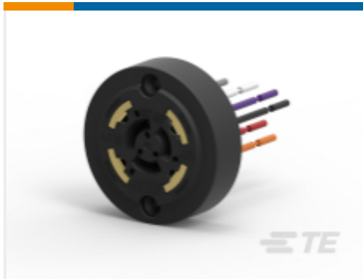
TE Part #2213362-3 DIMMING RECEPTACLE