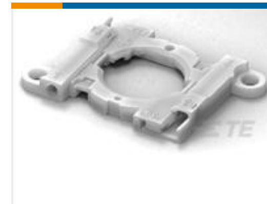
TE Part #2174024-1 LUMAWISE LED HOLDER, TYPE NL2