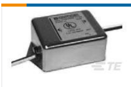
TE Part #2-6609092-3 3FL3=F5198