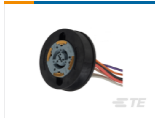
TE Part #2213627-2 DIMMING RECEPTACLE, ROTATABLE