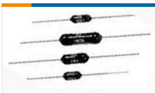
TE Part #1-1879666-9 H8 205K 0.1% 15PPM