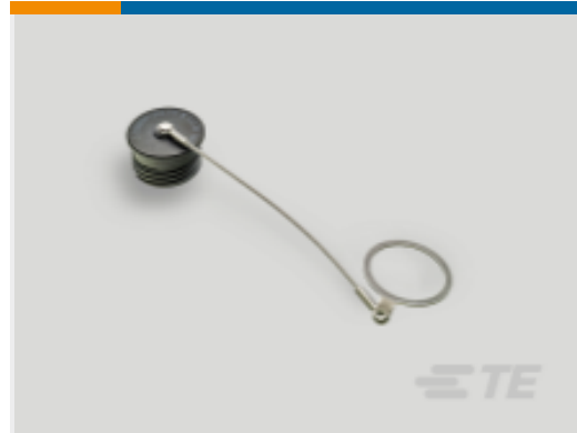
TE Part #YDTS32Z25NV0010000 CAP ASSEMBLY