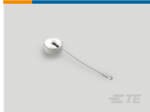
TE Part #YDTS33Z25RV0010000 CAP ASSEMBLY