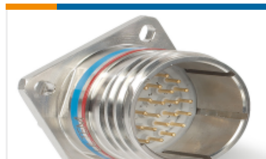
TE Part #YDTS20Z13-98PAV001 RECP ASSY