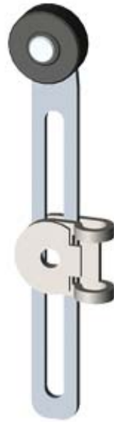
LENGTH-ADJUSTABLE TWIST LEVER FOR POSITION SWITCH 3SE51/52 METAL LEVER 100MM LONG PLASTIC ROLLER 19MM