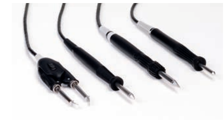
MFR-1100 Series Hand-pieces A. MFR-H4-TW Precision Tweezers B. MFR-H6-SSC SSC Soldering Cartridge C. MFR-H2-ST Soldering Tip D. MFR-H1-SC Soldering Cartridge