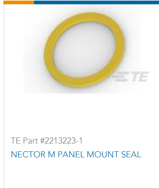
TE Part #2213223-1 NECTOR M PANEL MOUNT SEAL