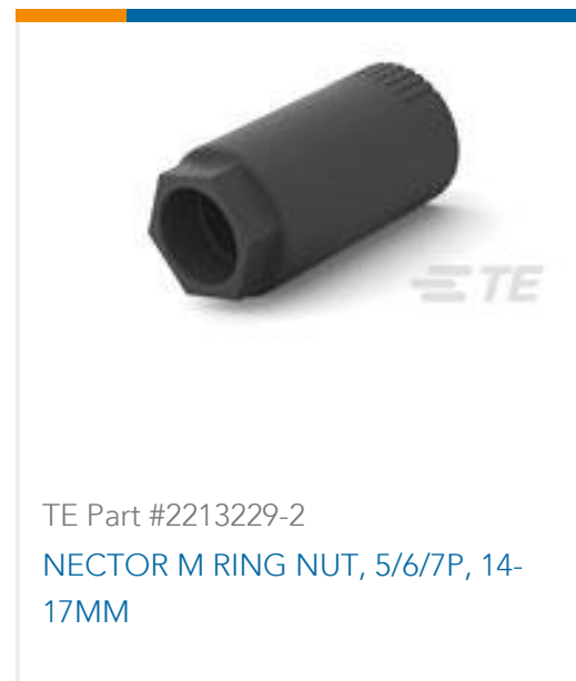
TE Part #2213229-2 NECTOR M RING NUT, 5/6/7P, 14- 17MM