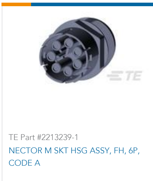
TE Part #2213239-1 NECTOR M SKT HSG ASSY, FH, 6P, CODE A