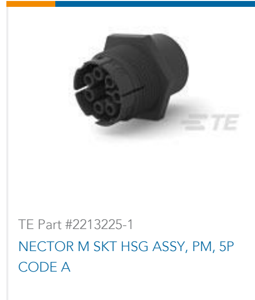
TE Part #2213225-1 NECTOR M SKT HSG ASSY, PM, 5P CODE A