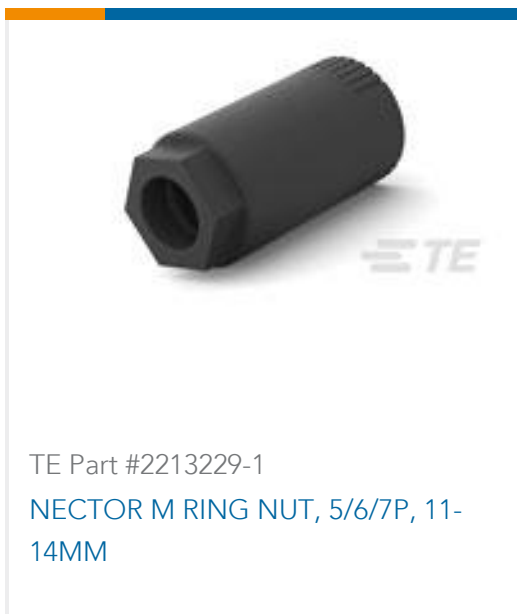
TE Part #2213229-1 NECTOR M RING NUT, 5/6/7P, 11- 14MM