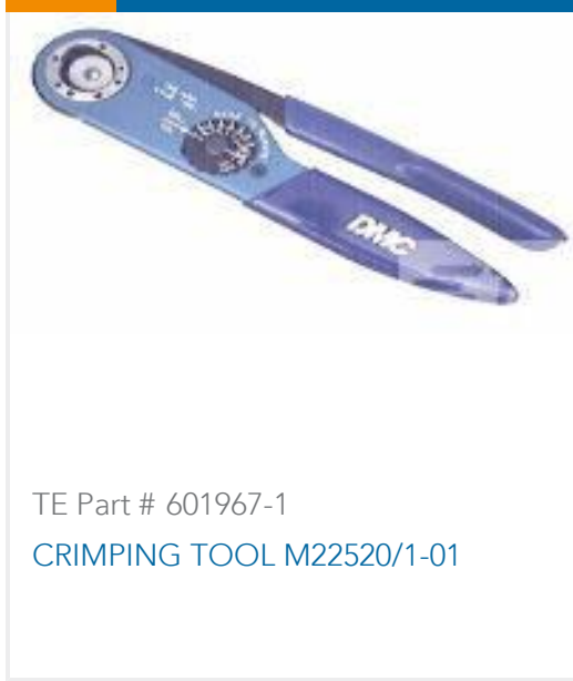
TE Part # 601967-1 CRIMPING TOOL M22520/1-01