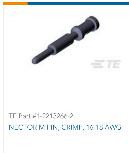
TE Part #1-2213266-2 NECTOR M PIN, CRIMP, 16-18 AWG