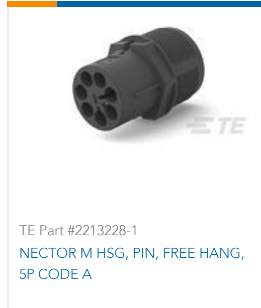
TE Part #2213228-1 NECTOR M HSG, PIN, FREE HANG, 5P CODE A