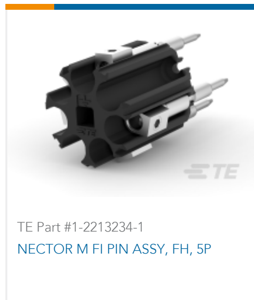
TE Part #1-2213234-1 NECTOR M FI PIN ASSY, FH, 5P