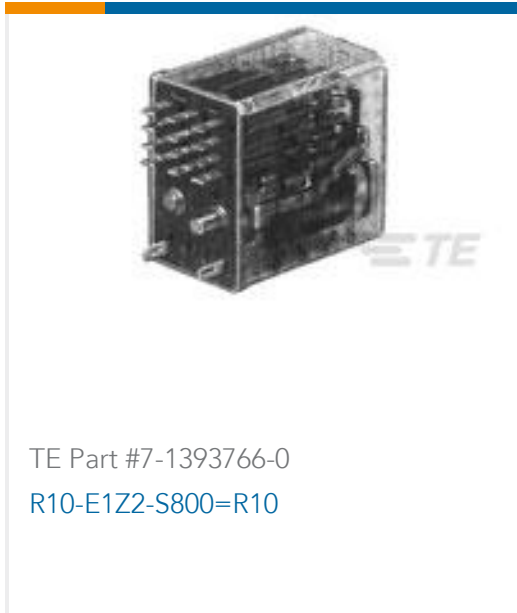
TE Part #7-1393766-0 R10-E1Z2-S800=R10