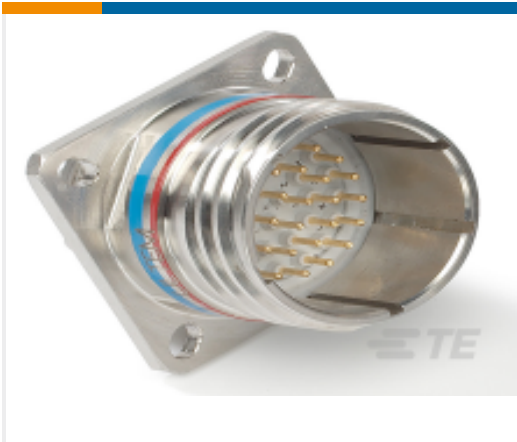
TE Part # YDTS20Z23-35ANV001 RECP ASSY