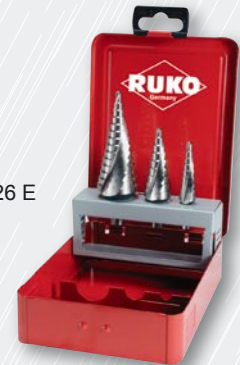
No. 101 026 E