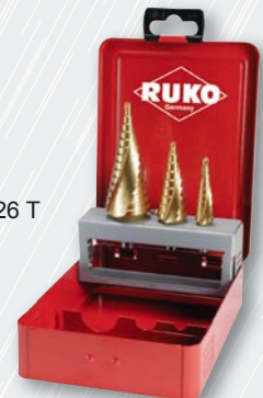
No. 101 026 T