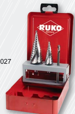
No. 101 027