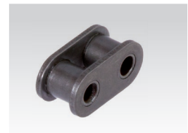
No. 4/B: Inner Link (2 pieces required)

Details: e.g.: Product No. 125 003 00GL, Connecting Link No. 11/E, 08 B-2-GL