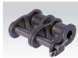
No. 12/L: Cranked Link with Cottered Pin