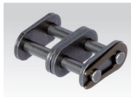
No. 11/E: Connecting Link with Spring Clip