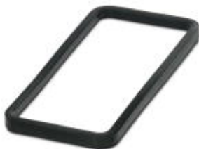
Profile gasket for HEAVYCON EVO supporting base element type B16

Please be informed that the data shown in this PDF Document is generated from our Online Catalog. Please find the complete data in the user's documentation. Our General Terms of Use for Downloads are valid ( http://phoenixcontact.com/download )