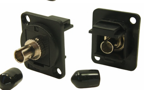
Part No. CP30218 CP30218X

Description Toslink, CSK Hole As above with Plain hole CP30217X