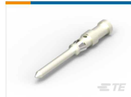
TE Part #T2020001005-000 CDM-0.5