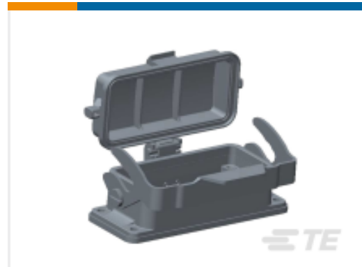
TE Part #T1510163000-000 H16B-AD-LB