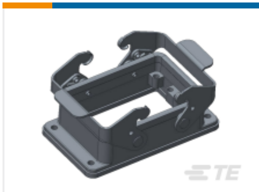
TE Part #T1419320000-000 H32A-AG