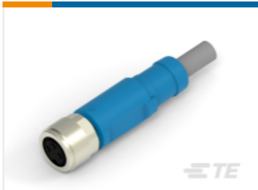
TE Part #T4051310003-004 M8 FEMALE STRAIGHT SINGLE END CABLE ASSY