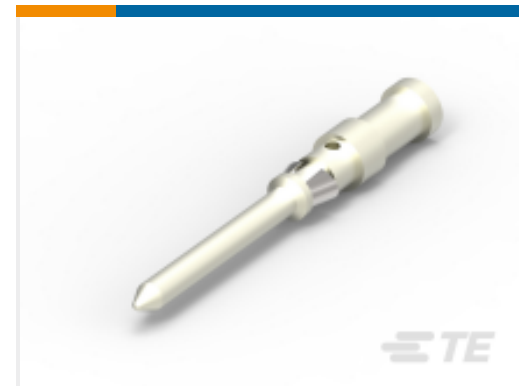
TE Part #T2020001010-000 CDM-1.0