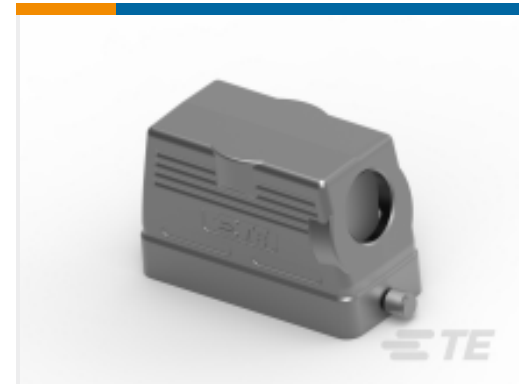
TE Part #T1310160125-000 H16B-TS-RO-M25