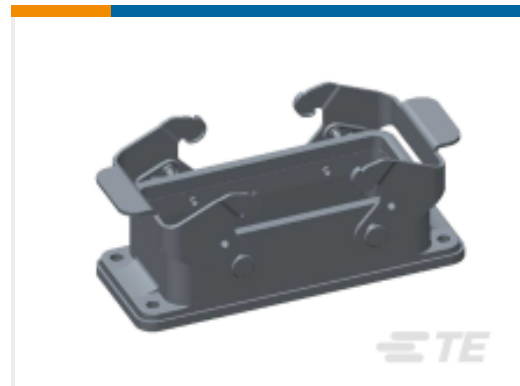
TE Part #T1410162000-000 H16B-AG