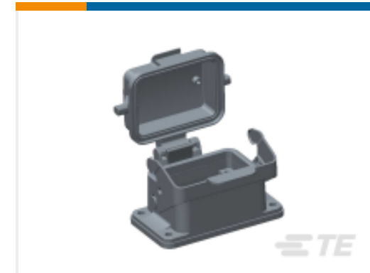
TE Part #T1510063000-000 H6B-AD