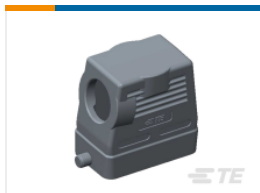
TE Part #T1330100132-000 H10B-TSH-RO-M32