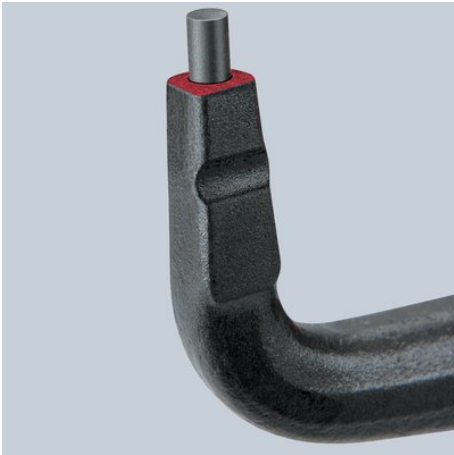
Sturdy, inserted tips: made from high-density spring steel