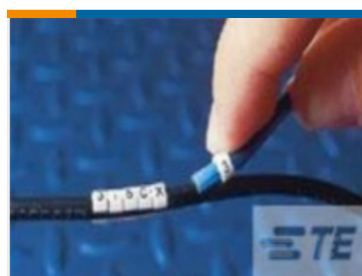
TE Part # 1-1768043-0 STD05W-M