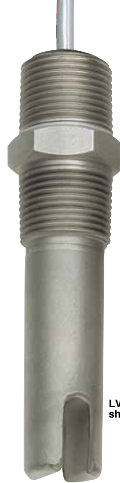
LVSW-701 shown actual size.