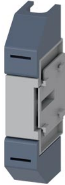
Accessory for 3KD0 size 01 Neutral conductor/ground terminal with fixed jumper Box terminal