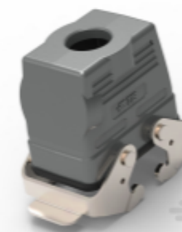
TE Part # T1710102116-000 H10B-TBF-PG16