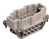
TE Part # T2040102101-000 HE-010-M