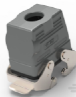
TE Part # T1710101116-000 H10B-TBFS-PG16