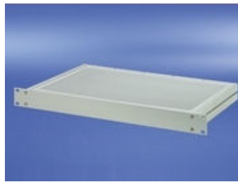
Photo shows 1 U