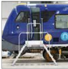
5 Tread shown in use as a rail carriage driver door access step