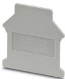
End cover, Length: 42.5 mm, Width: 1.5 mm, Height: 54 mm, Color: gray

Please be informed that the data shown in this PDF Document is generated from our Online Catalog. Please find the complete data in the user's documentation. Our General Terms of Use for Downloads are valid ( http://phoenixcontact.com/download )