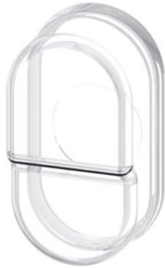
Silicone protection cap for Twin pushbutton, high, clear