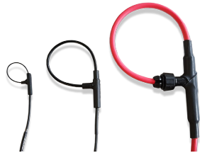
4 different coil sizes, 80mm, 100mm, 200mm or 300mm coil circumferences. See the Data Sheet for more details.