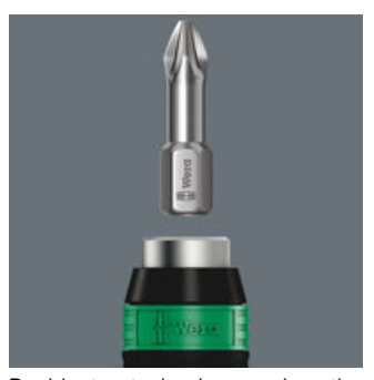
Rapidaptor technology makes the tool adaptable since bits and sockets can be exchanged rapidly.