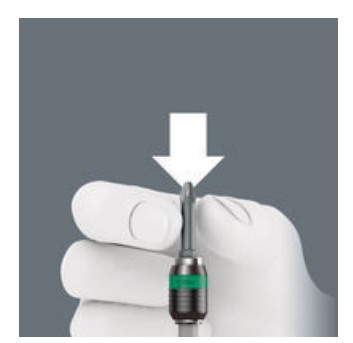
The bit can be pushed into the adaptor without moving the sleeve. The lock is activated automatically as soon as the bit is applied to the screw. Bits are held securely and wobble-free.