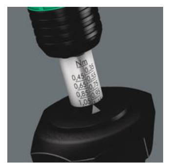
Easy-to-read scale value.