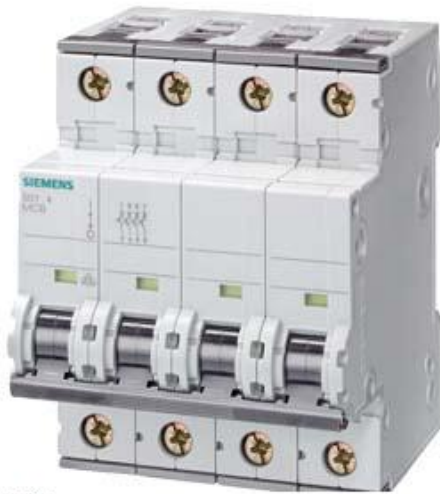
CIRCUIT BREAKER 400V 10KA, 4-POLE, A, 32A, D=70MM