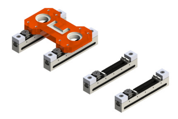
For machining large workpieces. Including supports with a height of 15 mm. Art. No. 1586.416