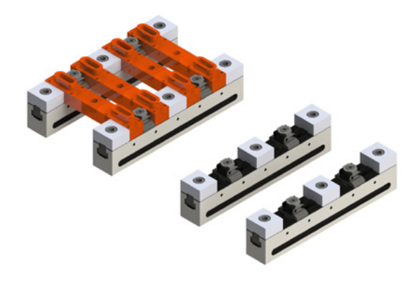
Two ranges of 1586.410. Particularly well suited for machining long workpieces. Art. No. 1586.411