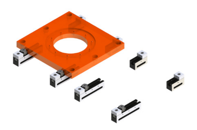
For machining large workpieces. Art. No. 1586.414