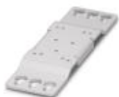
Universal wall adapter for securely mounting the power supply in the event of strong vibrations. The power supply is screwed directly onto the mounting surface. The universal wall adapter is attached at the top/bottom.

Assembly adapters - UWA 182/52 - 2938235