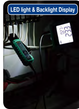
LED light & Backlight Display