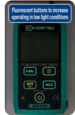
Fluorescent buttons to increase operating in low light conditions