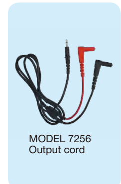
MODEL 7256 Output cord