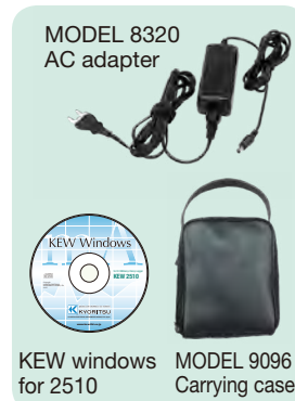
MODEL 8320 AC adapter KEW windows for 2510 MODEL 9096 Carrying case