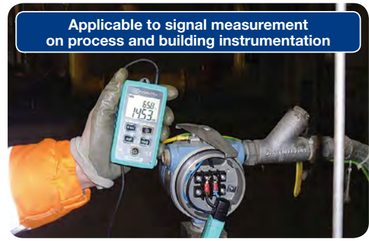
Applicable to signal measurement on process and building instrumentation