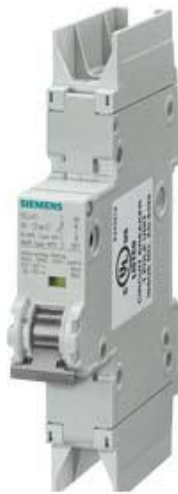
CIRCUIT BREAKER 10KA, 1POLE, C, 30A ACC. TO UL 489 - 277V