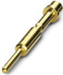
Crimp contact, turned, contact diameter: 1 mm, crimp range: 0.25 mm 2 ... 1 mm 2

Please be informed that the data shown in this PDF Document is generated from our Online Catalog. Please find the complete data in the user's documentation. Our General Terms of Use for Downloads are valid ( http://phoenixcontact.com/download )