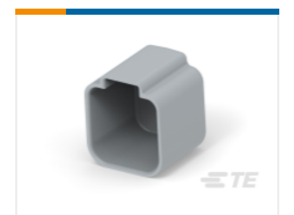
TE Part # DT6P-DC PROTECT CVR, 6P, REC, GRY, DT