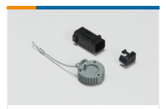
Automotive Connector Caps & Covers