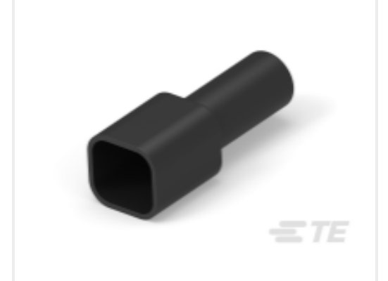
TE Part # DT6P-BT-BK BOOT, 6P, REC, ST, BLK