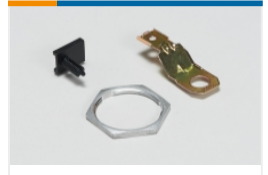
Other Automotive Connector Accessories(14)