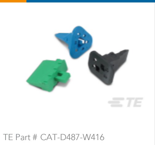
DEUTSCH DT WEDGELOCKS