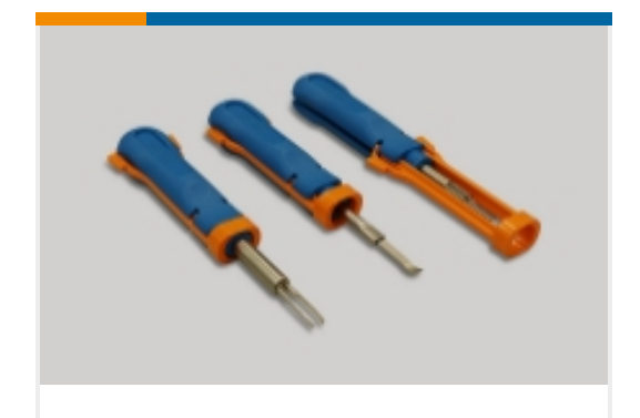
Insertion & Extraction Tools(3)