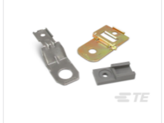
TE Part # CAT-D487-M8649 DEUTSCH DT MOUNTING CLIPS