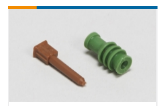
Automotive Seals & Cavity Plugs(4)