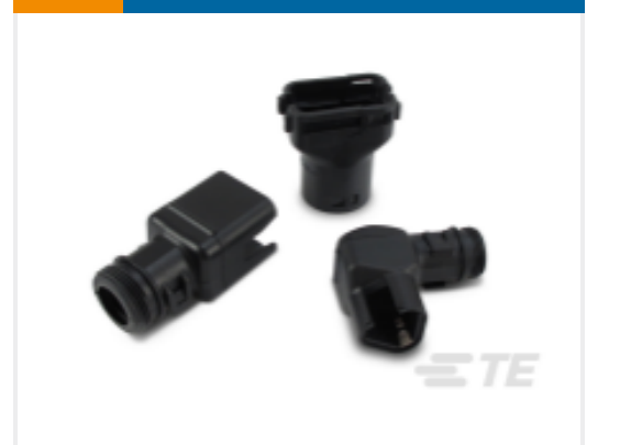
TE Part # CAT-D487-B128 DEUTSCH DT BACKSHELLS