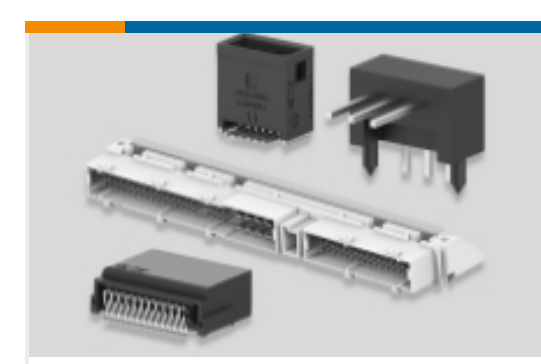
PCB Connector Headers & Receptacles (83)