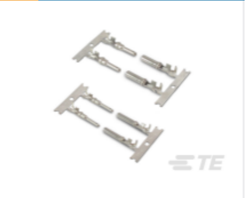
TE Part # CAT-D48-SFT273 DEUTSCH STAMPED & FORMED CONTACTS