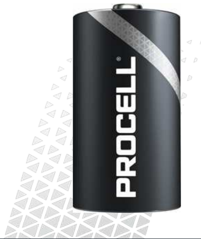
Size: D (LR20) PC1300