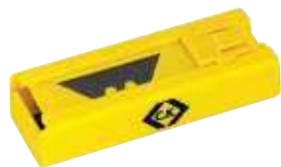
Spare blades - Standard