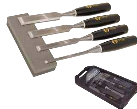
Wood chisels & sharpening stone set

CONTENTS: 1 x wood chisel, sizes: 6, 13, 19, & 25mm. Sharpening stone.