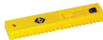
Spare blades - Snap off