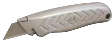
Trimming knife - Non retractable