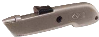
Trimming knife - Auto retracting