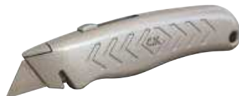
Trimming knife - Retractable