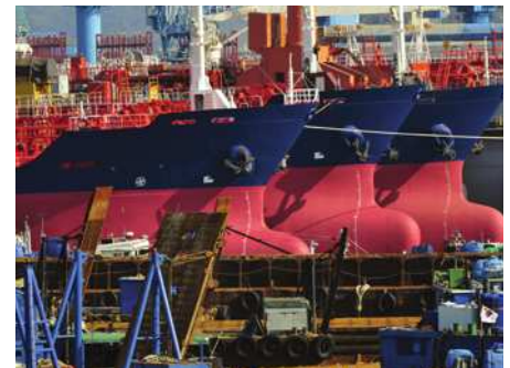
Dockside Loading Equipment