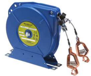
Static Discharge Grounding Reel with Double-Clamp Cable