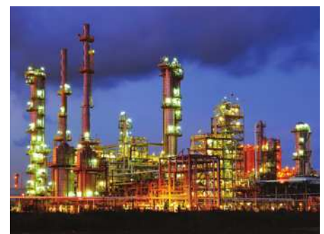
Chemical Plants / Refineries