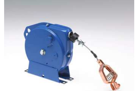
Static Discharge Grounding Reel with Single-Clamp Cable