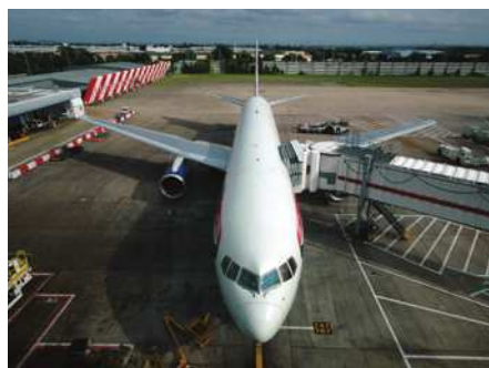
Airplanes / Refueling