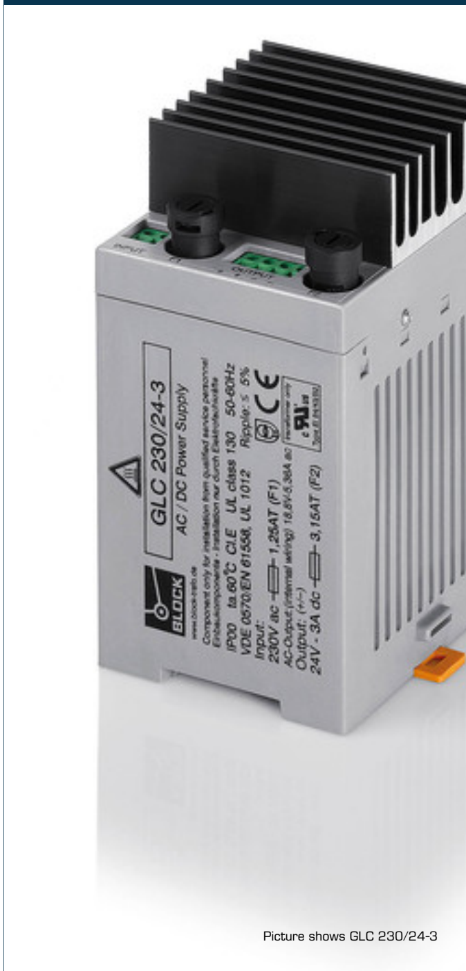
Picture shows GLC 230/24-3