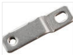
Wall brackets, screw-on at rear