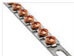
Earthing bars with fitted terminal clamps