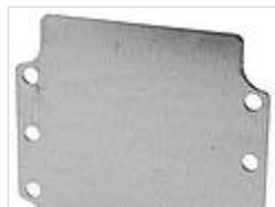
Mounting panels, laminated paper (P 305-329) or galvanised sheet steel (P 330-355)

For A 119, A 122, A 124-125, A 130, A 135, A 140-168, A 170-190