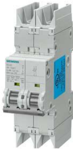
CIRCUIT BREAKER 10KA, 2POLE, D, 15A ACC. TO UL 489 - 480Y/277V