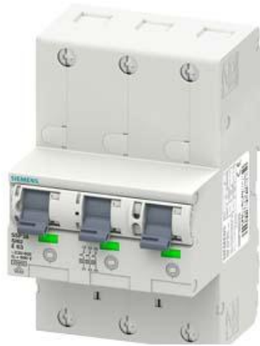
MAIN CIRCUIT BREAKER (SHU), 3X1POLE, E 35, 400V