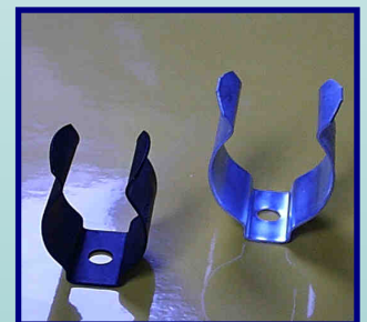
Snap fit Mounting Clips