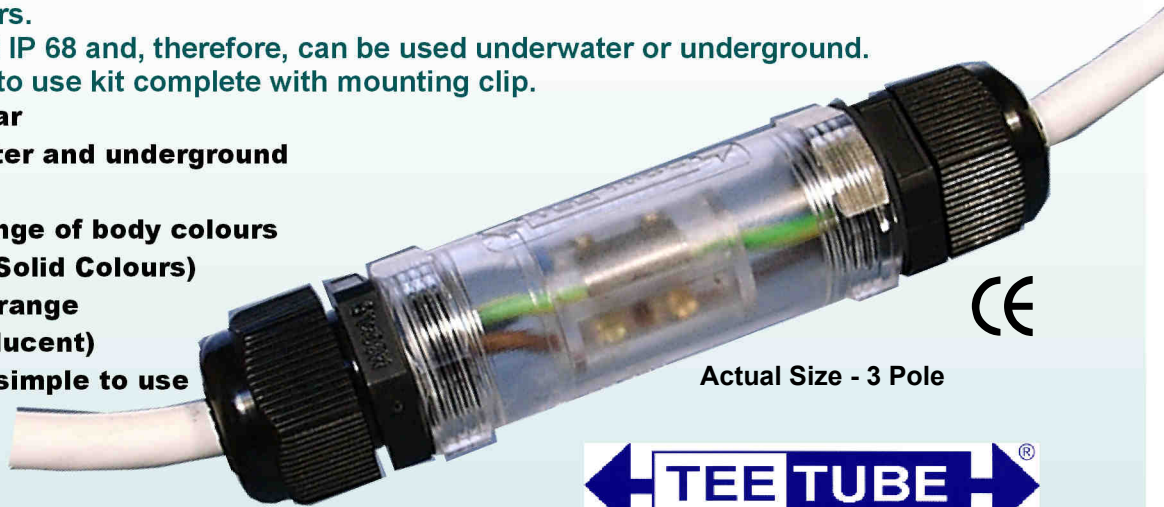
Actual Size - 3 Pole