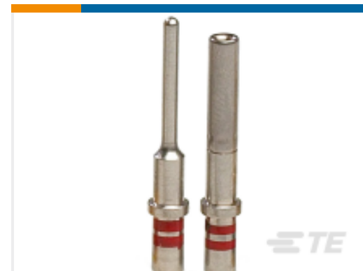
TE Part #ZPF0000000000001261 097-0267-16 A1267