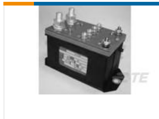
TE Part #1616058-6 A703CD (FAA/PMA)=RELAY