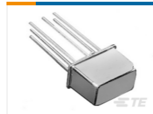
TE Part #1617147-5 JMGAP-26P = M39016/17-030P