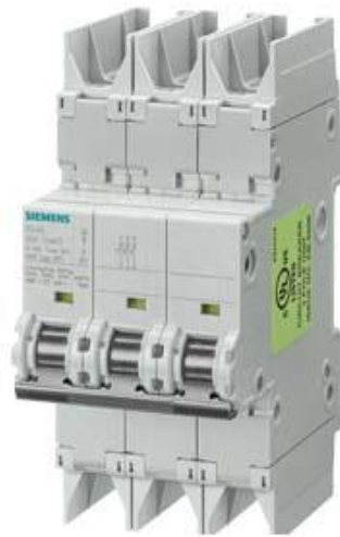
CIRCUIT BREAKER 10KA, 3POLE, C, 13A ACC. TO UL 489 - 480Y/277V