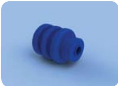
Single Wire Seal