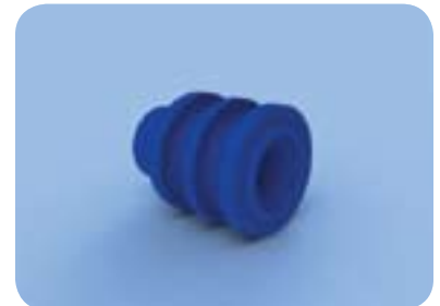
Single Wire Seal