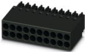
The figure shows a 10-pos. version with 20 contacts

PCB connector, nominal current: 6 A, rated voltage (III/2): 160 V, Nominal cross section: 0.75 mm 2 , number of positions: 5, pitch: 2.54 mm, connection method: Crimp connection, color: black