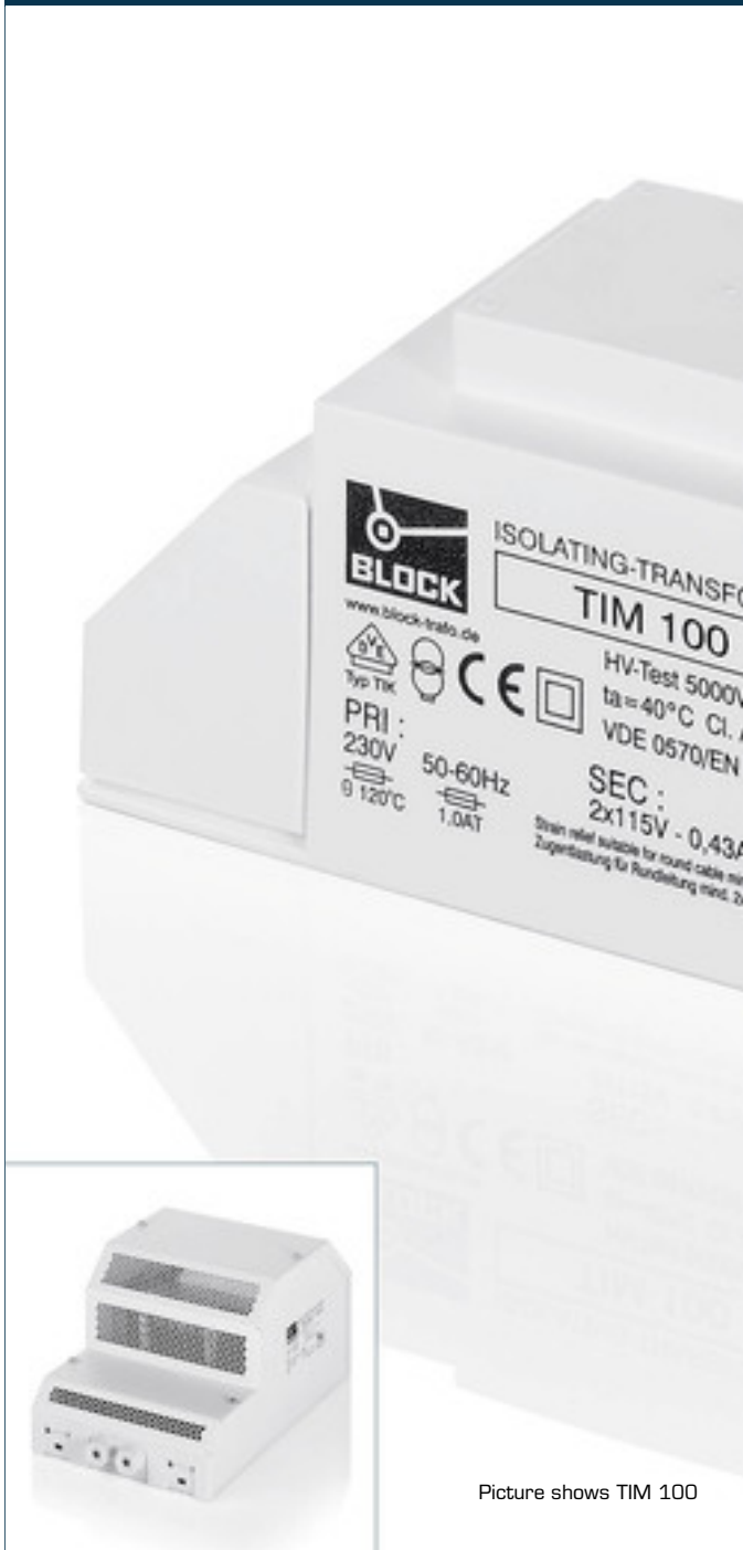
Picture shows TIM 100