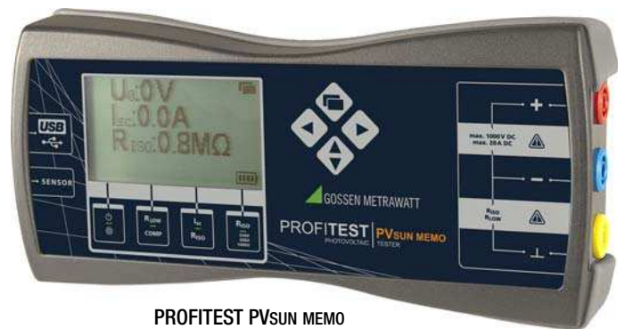
PROFITEST PVsUN MEMO