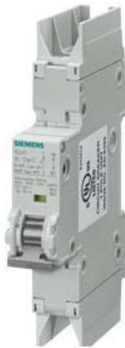
CIRCUIT BREAKER 10KA, 1POLE, D, 2A ACC. TO UL 489 - 277V