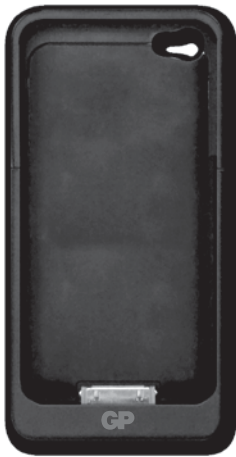
Protective Case / Power Pack