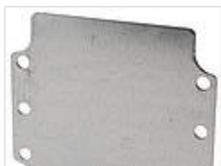
Mounting panels for PK 105 - 115, galvanised sheet steel