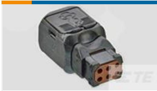
TE Part #D369-P66-NS0 369 6 WAY PLUG, NO CONTACTS, SKT