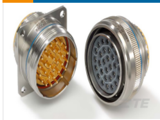
TE Part #ZPF000000000008814 983-6SE 12-12 SN