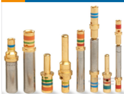
TE Part #38941-16 CONTACTS