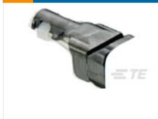
TE Part #D369-STB-6 369 6 WAY BACKSHELL STRAIGHT TIE WRAP