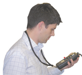
Take the reading