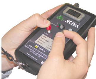
Press the reset button. Null the offset trimmer to zero

The DCflex current probe is simple to use